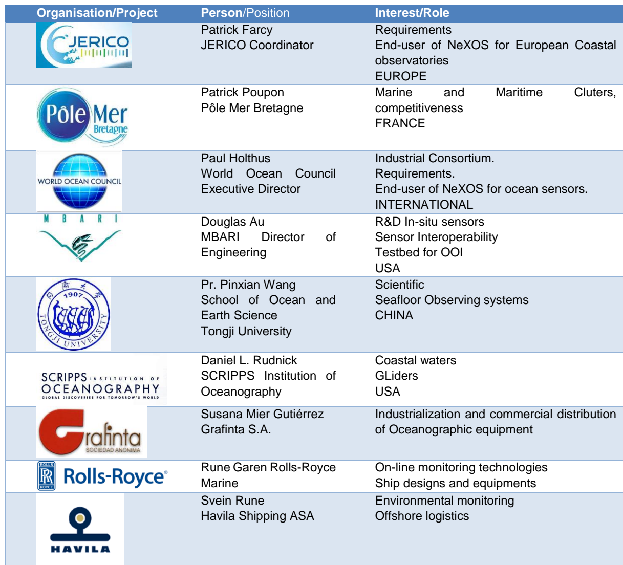
TABLE 7.1 CURRENT NEXOS ASB MEMBERS